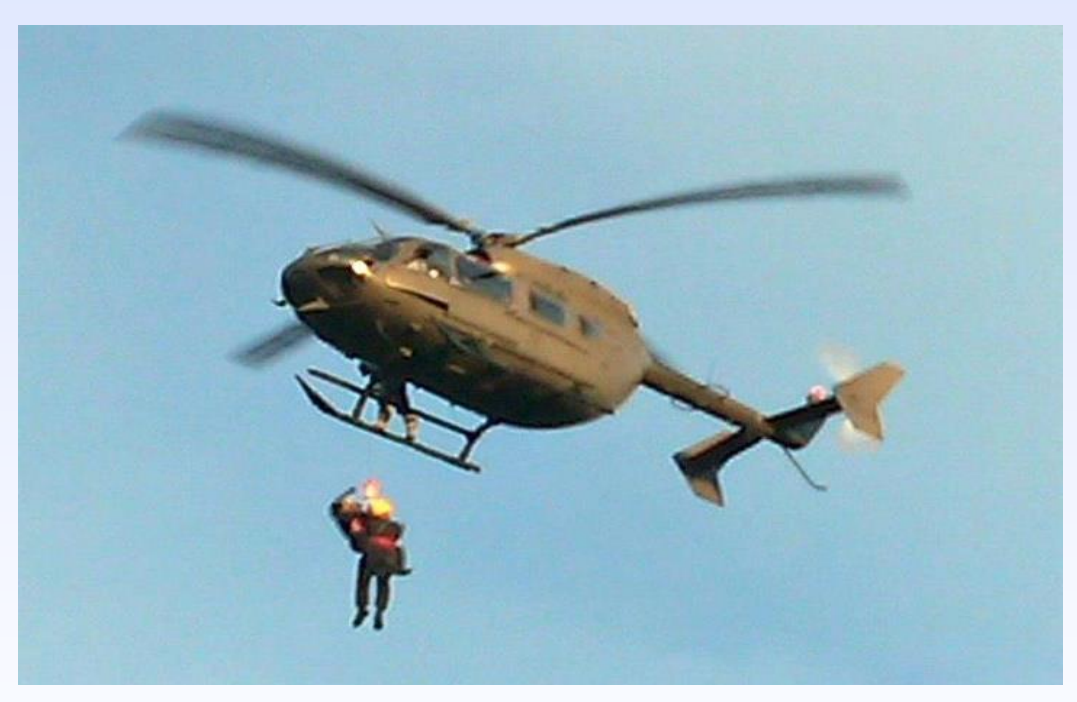
UH-72 IS A HOIST ONLY AIRFRAME